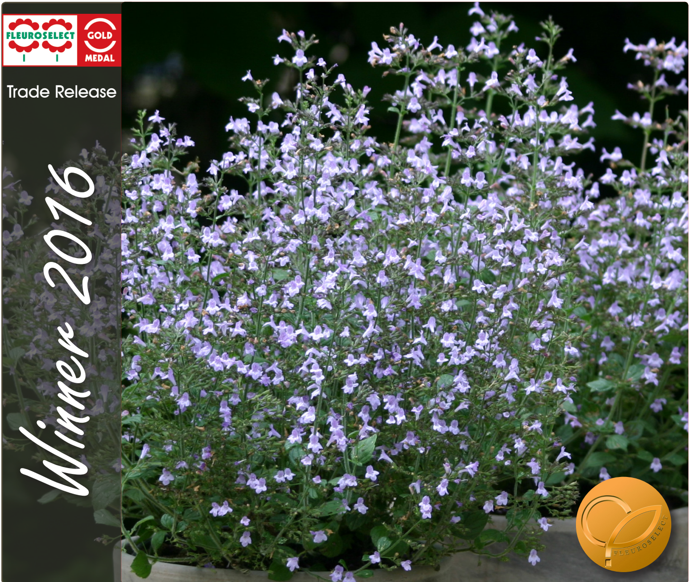
Marvelette Blue, a bee-friendly marvel for the patio and garden.

A marvellous, blue bee attraction, that's what this compact Calamintha from seed will create in the garden! Its large, striking, purple-blue flowers are produced in profusion on upright spikes above the foliage. This first-year flowering perennial flowers within 12 weeks from a spring sowing and will bring blue to the garden all summer long. The sweet, mint smell of the fresh, mid-green foliage attracts butterflies and bees. This outstanding garden performer makes a great filler in sunny borders, but can also be used as a superb edging for walks.